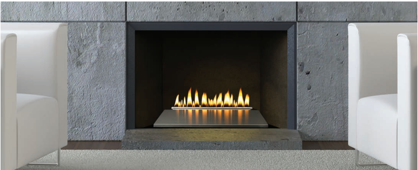
Loft Series Vent-Free Burner (VFRL-24) with Stainless Steel Decorative Top (DT-24-SS). Shown in existing masonry firebox.

A vent-free Millivolt Loft Burner may also be installed as a decorative appliance in a vented fireplace to provide ambiance and light – but without the heat. In a vented installation, the burner cannot be operated by thermostat, and the flue damper must be blocked open. A damper clamp is included with all Loft burners. Because IP Loft Burners include a thermostat remote and may not be installed as decorative appliances, a non-thermostat remote is available.