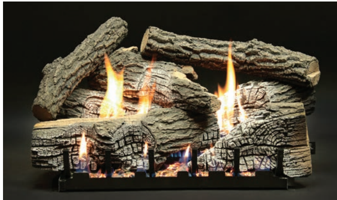
Super Stacked Wildwood Refractory Log Set (LS24WRS) with Vent-Free Slope Glaze Burner System (VFSR-24)