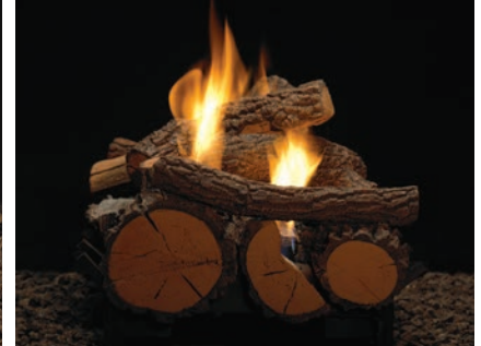
Opposite Side View (above) and End View (below)