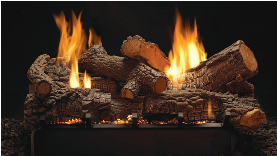
Rugged Refractory logs give the Rock Creek Log Set (LSU-24RR) a rustic look on a grand scale.