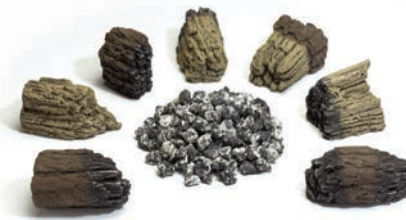
EK-2 Large Ember Kit available for Multi-sided log sets or large fireplaces.

Member of the following industry associations: