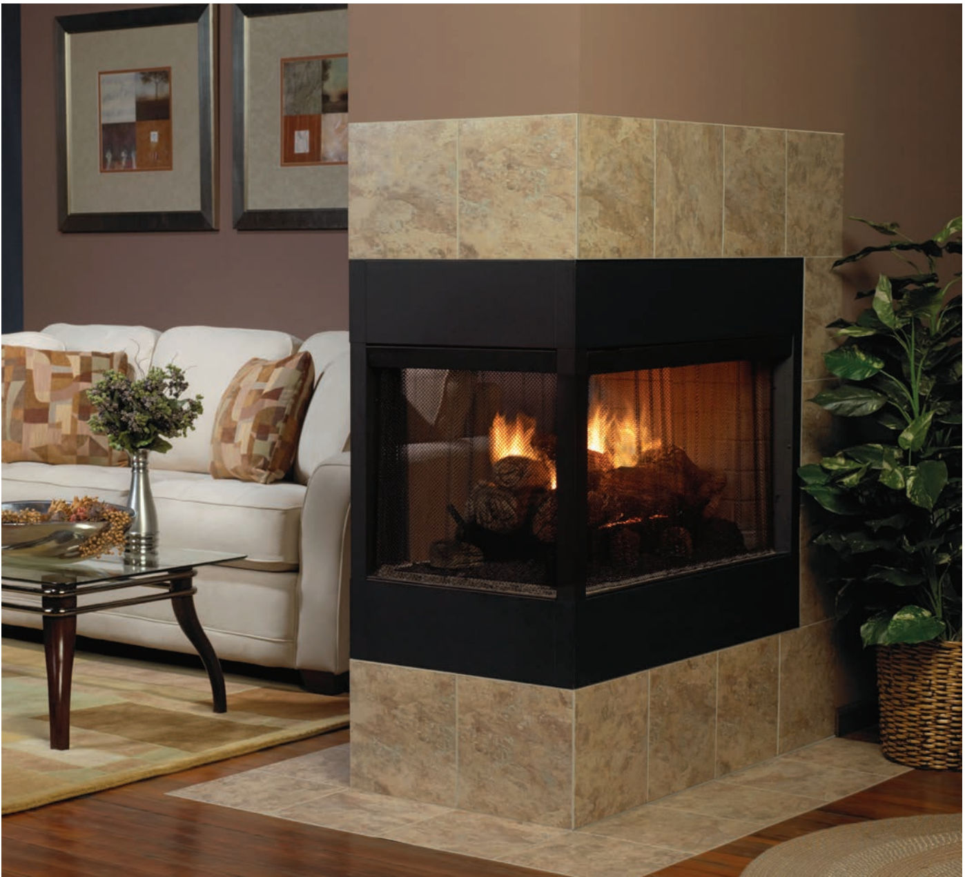
White Mountain Hearth Stone River Log Set (LSU-24SF) on a Vent-Free Slope Glaze Vista Burner. Shown in a peninsula firebox with custom tile surround. The optional Large Log Embers Kit (EK-2) and Platinum Glowing Embers (PE20) add that extra spark of realism.