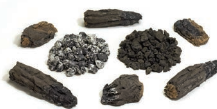
EK-1 Traditional Ember Bed Kit includes six burnt log pieces, white ash, and lava rock.