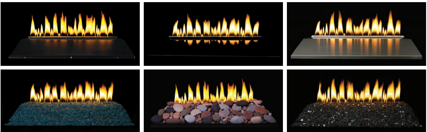
Top Row left to right: No Decorative Options, Polished Black Decorative Top, Brushed Stainless Steel Decorative Top. Bottom Row left to right: Blue Clear Decorative Glass, Medium Decorative Rocks and Accent Pebbles, Polished Black Decorative Glass. (Clear Frost Decorative Glass shown on opposite page)