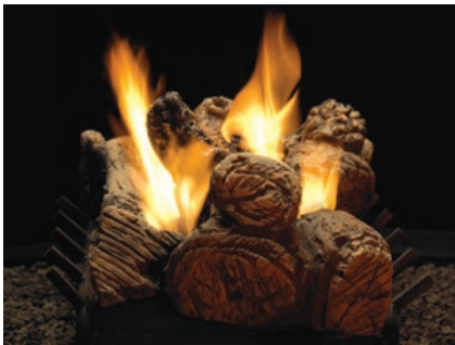
Opposite Side View (above) and End View (below)