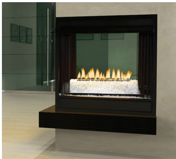
Loft Series Vent-Free Multi-sided burner (VFRU-24) with Clear Frost Decorative Glass (DG-30-CLF). Shown in a Vent-Free peninsula firebox with Flush Louvers.