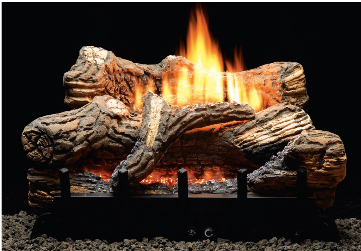
Flint Hill Ceramic Fiber Log Set and Vent-Free Burner Combination (VFDR-24-LB)

This competitively priced log/burner is ideal for existing fireplaces and fireboxes and for new construction.