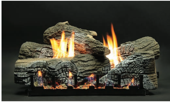
Stacked Wildwood Refractory Log Set (LS24WRR) with Vent-Free Slope Glaze Burner System (VFSR-24)