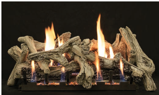
Driftwood Burncrete® Log Set (LS-24CD) with Vent-Free Slope Glaze Burner System (VFSR-24)