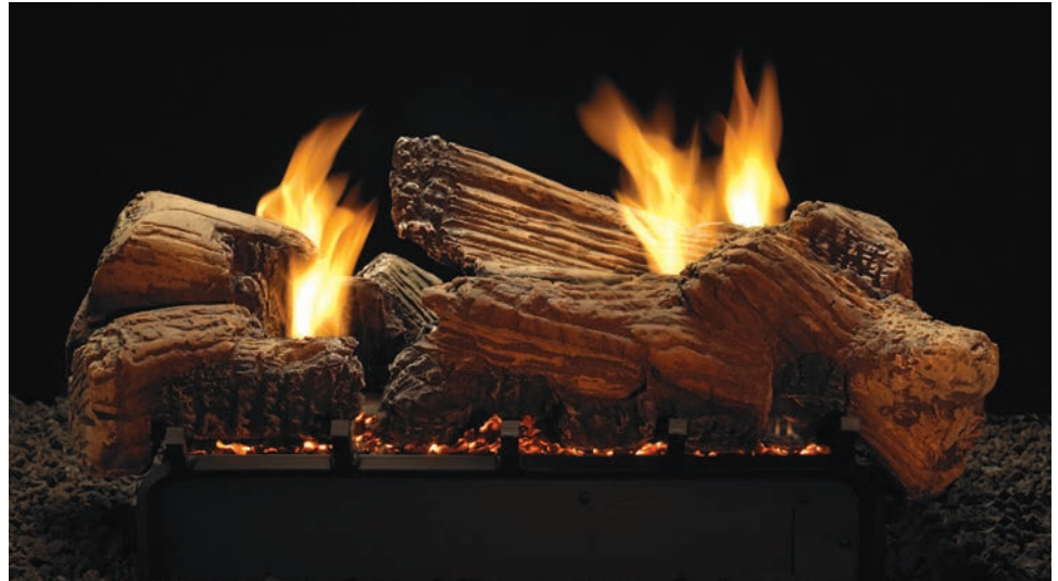
The Stone River Ceramic Fiber Log Set (LSU-24SF) provides a different look from every angle. The Vent-Free Slope Glaze Vista Burner (VFSUR-24) neatly conceals its controls behind a sliding panel.