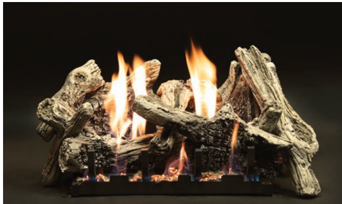
Driftwood Burncrete® Log Set (LS-18CD) with Vent-Free Slope Glaze Burner System (VFSR-18)